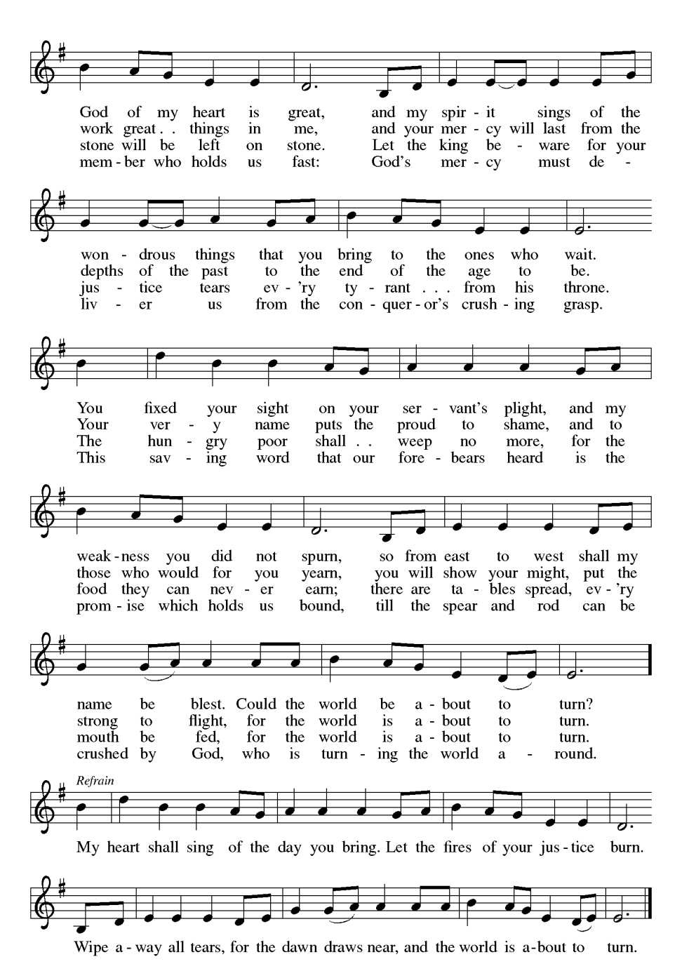
Text: Rory Cooney, based on the Magnificat ©1990 GIA Publications, Inc. Music: Star of County Down. Reprinted and broadcast with permission under OneLicense #A-725886